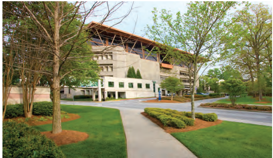
Emory Eye Center, 1365-B Clifton Road NE, Atlanta, Georgia

1991 Under the leadership of Ned S. Witkin, OD, the infrastructure of optometry and low vision services is built. This grows into a vital part of the Department of Ophthalmology. A new state-of-the-art clinic for vision and optical services is created on the main campus thirteen years later.