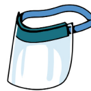
Face shield or goggles