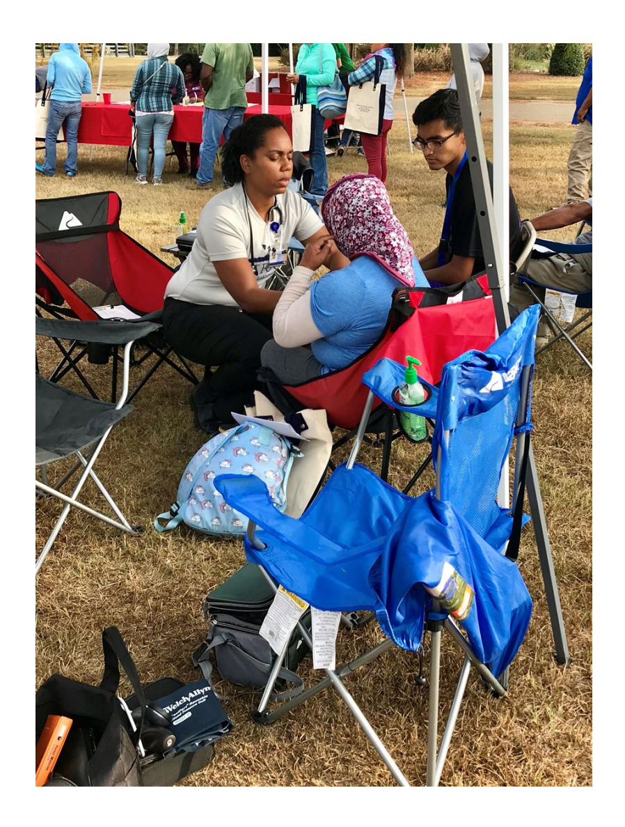
Above: Providing care in the field