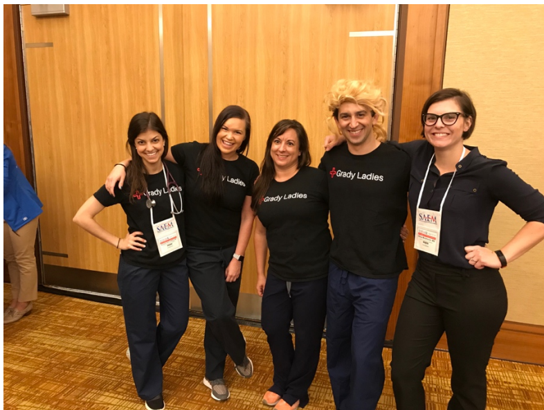
SAEM Grady “ladies”